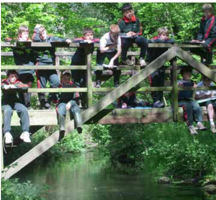
Form 6 going a bridge too far. (Geography field trip to Liphook)