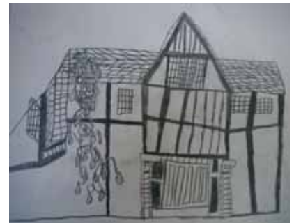
Josef Moore's drawing of the classroom