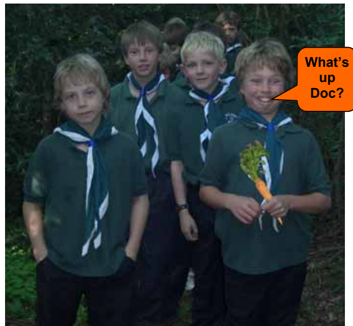
Cubs and "rabbits" playing wide game in the woods.