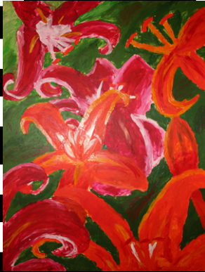
Giles Tyler—8R Acrylic Fingerprinting