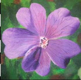
George Gilligan Court—8R Acrylic