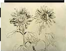
Sabastian Fomin Etching Week 5