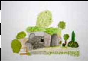
William Tennent 6T Watercolour Week 1