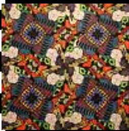
Samuel Turner Tile Design Week 4